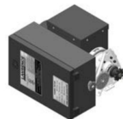
NEMA 4 Modification (NEMA 4X similar)