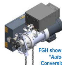
FGH shown with AR-C "Auto-Reset" Conversion Module*