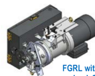
FGRL with Internal Lock Sensor